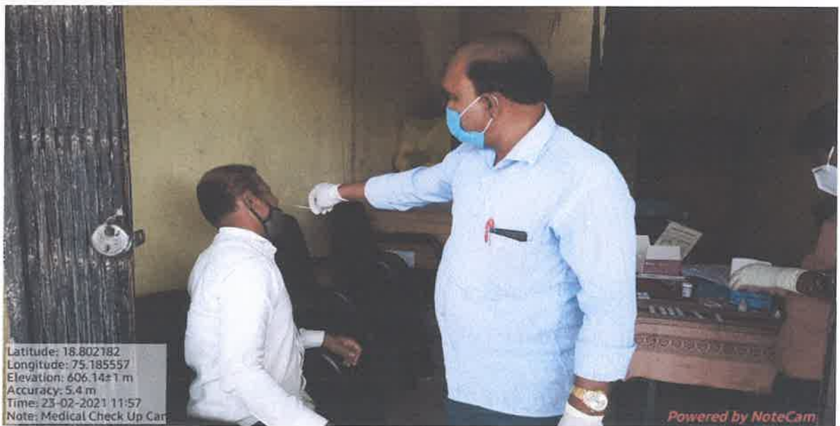
Taking Sample of Corona Antigen Test