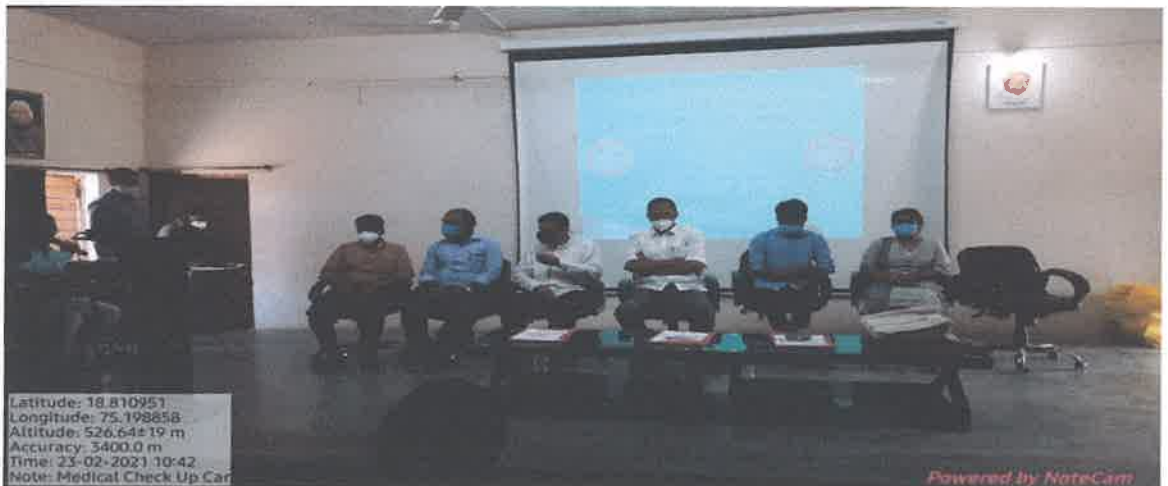
Inauguration Programme of Health Checkup Camp