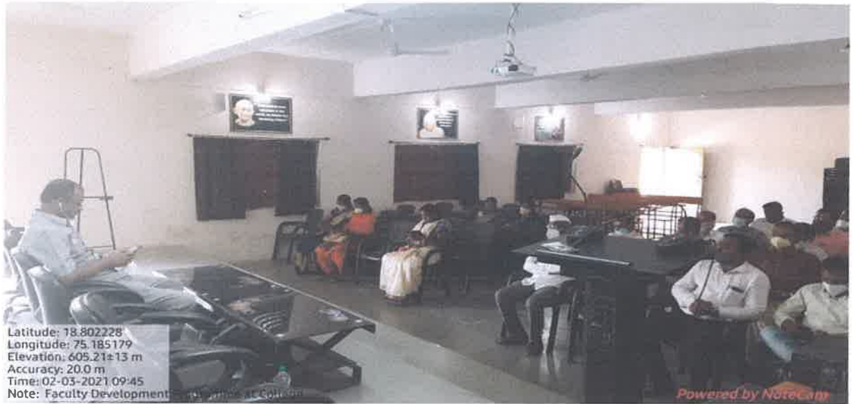
All Faculty Members are seating in Auditorium for Online Faculty Development